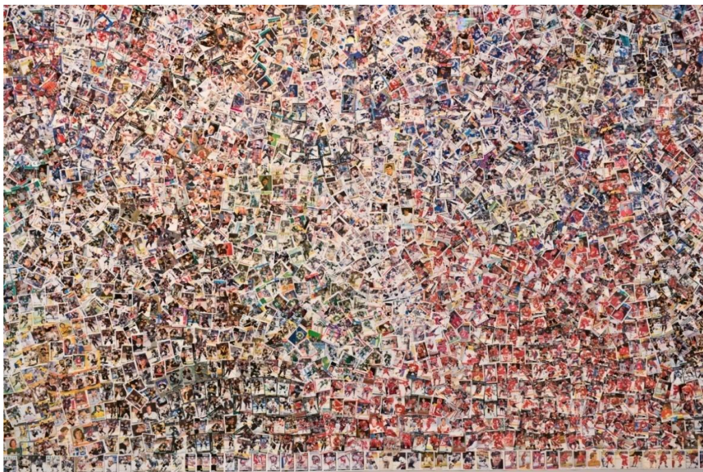
Close up of hockey cards used