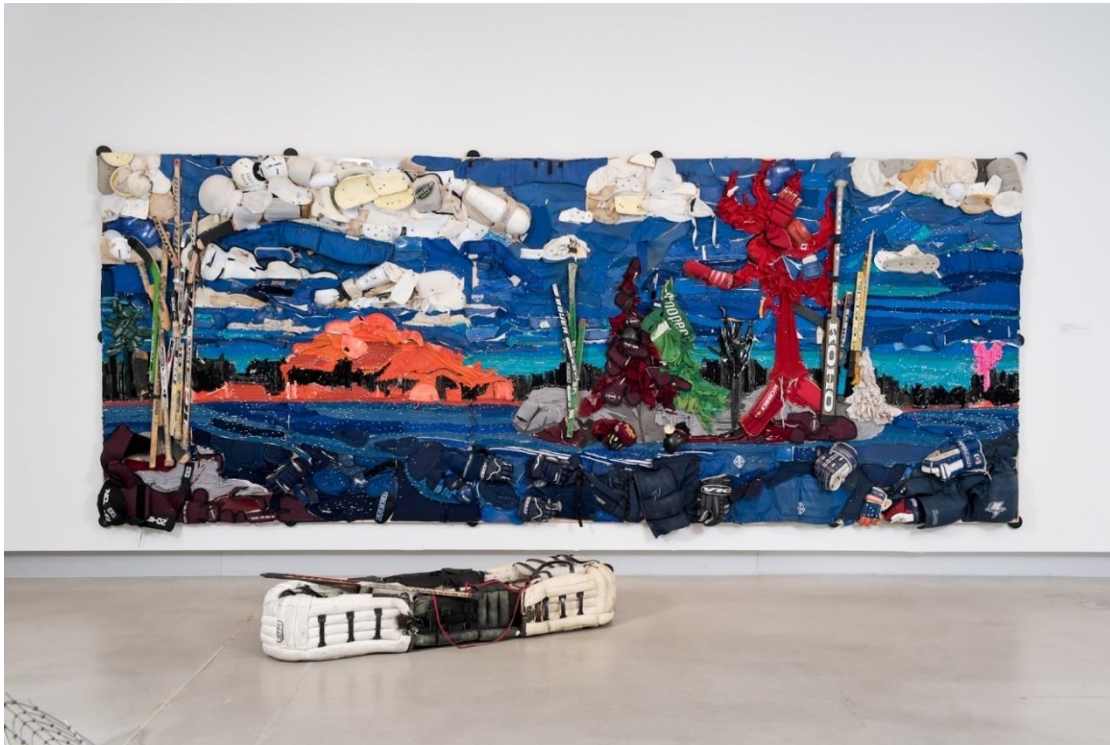
Close up of mixed media used