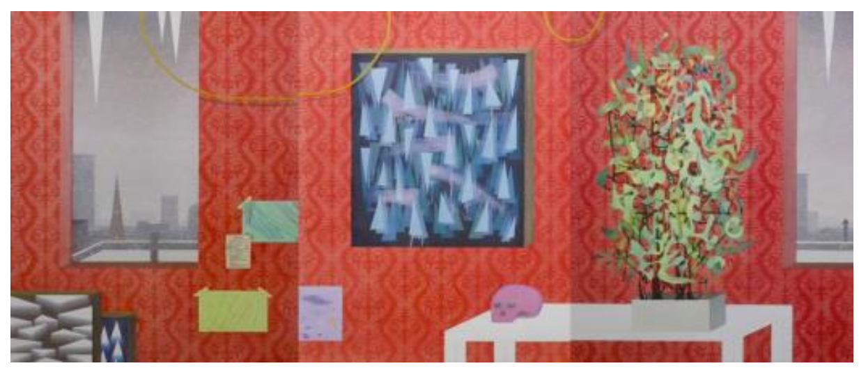
Simon Hughes, Canadian (1973-) Red Studio, 2013 Watercolour, gouache, coloured pencil, and acrylic Xerox transfer on paper 152.4 \times 304.8 \ \text{cm} Claridge Collection © the artist

Take inspiration from his studio artworks, if you were to make a wall that showed who you are, what would it look like?