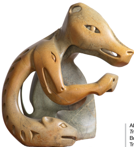
Abraham Anghik Ruben (1951-) Transformation , 2009 Brazilian soapstone Transfer from the Museum of Inuit Art, 2016 © Abraham Anghik Ruben

Inuit sculptures, prints, drawings, and dolls reflect the deep connection between artists and their environment. Explore Inuit artistic expression and culture in a selection of works from PAMA's permanent collection.