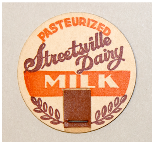
Streetsville Dairy milk bottle cap PAMA Museum collection