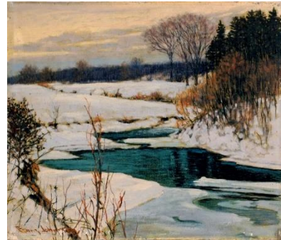
Frank (Franz) Johnston, Canadian 1888 – 1949, Close of Day n.d., oil on masonite. Gift of the Peel County Historical Society. PAMA Art Collection.

A landscape is a painting of nature – something you might see when you look out of a window. Can you think of some examples of what you might see in a landscape? How about the sky, grass, trees, flowers, a beach or mountains?