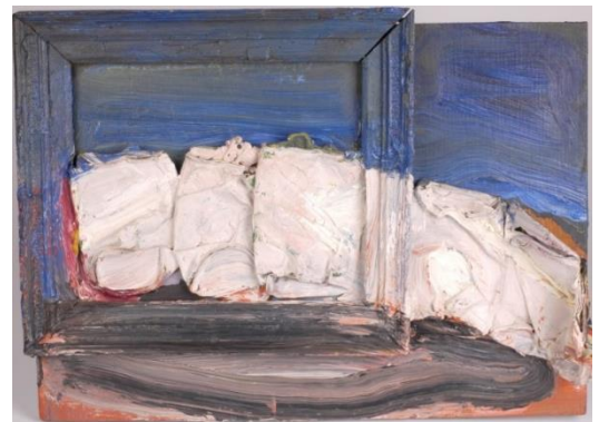
Gordon Rayner, Canadian 1935 – 2010, Out of the Picture 1983, oil paint, cans, wooden frame. Gift of Ron & Tabita Moore. PAMA Art Collection. © Estate of the Artist

Abstract art doesn't show anything from real life. The artist uses lines, shapes and colours to express ideas and feelings.