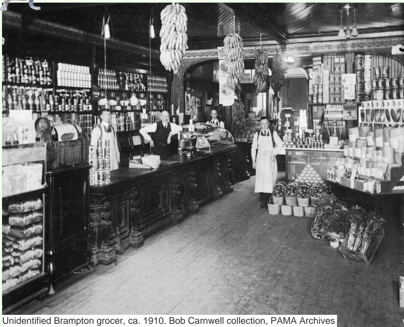
Unidentified Brampton grocer, ca. 1910. Bob Carnwell collection, PAMA Archives

Pictured here is a photo of a Brampton grocer from the PAMA Archives collection. It might look a little different than the stores you go to. This photo was taken over 100 years ago!