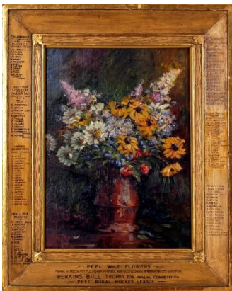
Mary E. Dignam Canadian 1857 – 1938, Peel Wild Flowers 1925, oil on canvas Gift of the Town of Caledon. Perkins Bull Collection. PAMA Art Collection.

A still-life is an artwork that is made by studying objects that don't move. An artist will usually set up objects like a vase with flowers or fruits in a bowl to create their art from.