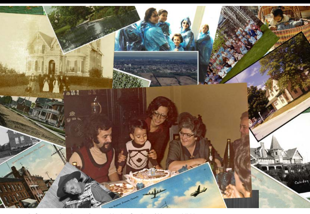
Community photos featured in the Stories of Home exhibition