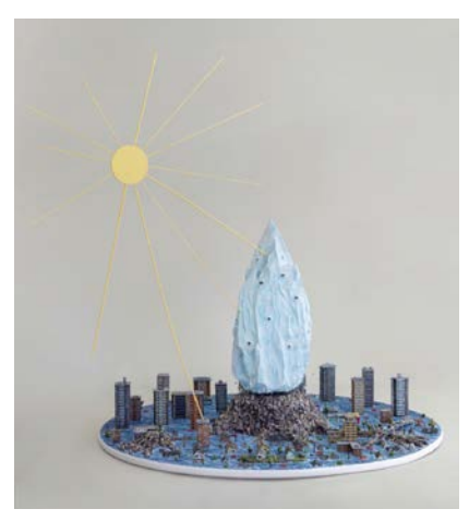
Jude Griebel, Ice Cap . Wood, air-drying clays, papier-mâché, acrylic, textile, blown glass, glass beads, 2018

This exhibition is a series of miniature, sculptural scenes that tell stories about the end of the world. The tiny worlds reflect our own consumerist, industrialized, and polluted modern way of life and the inevitable destructive impact on the environment.