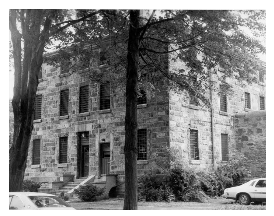
Peel County Jail, around 1970